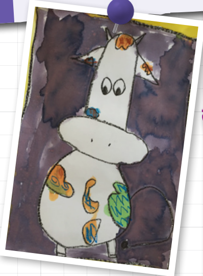
Creates artworks by drawing and painting