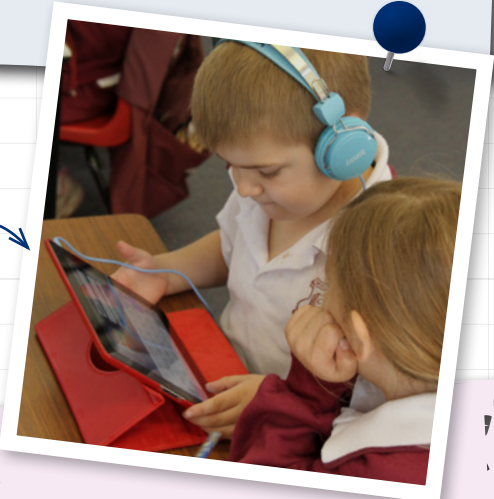
Uses a tablet to sequence steps